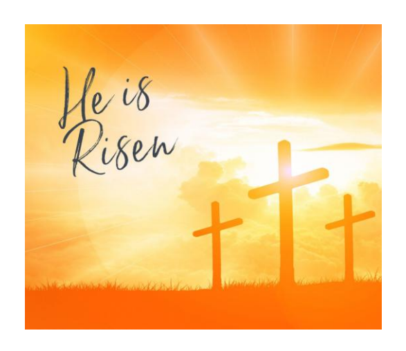
Friday, April 7 – Monday, April 10 NO SCHOOL